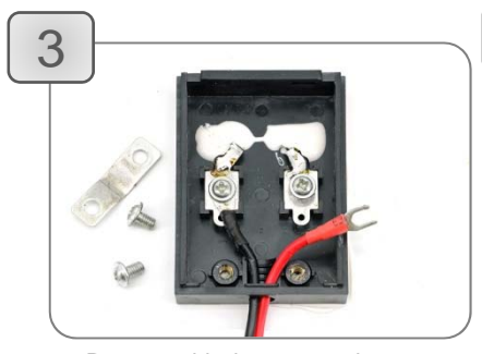
Remove old wires, or cut them out if they are soldered