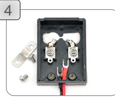
Replace with the new wiring kit, feed fork terminals through hole.