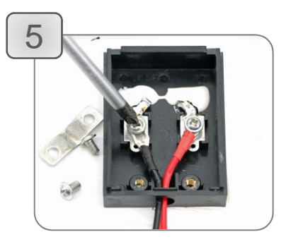
Attach the new fork terminals to the screw terminals