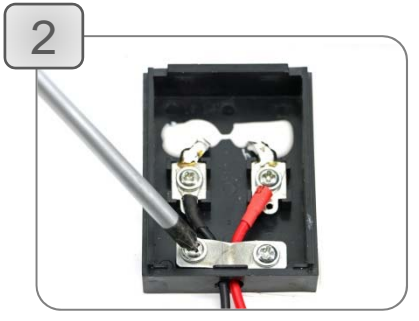
Remove the cover Remove the wire clamp