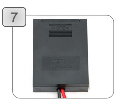
Replace the cover.