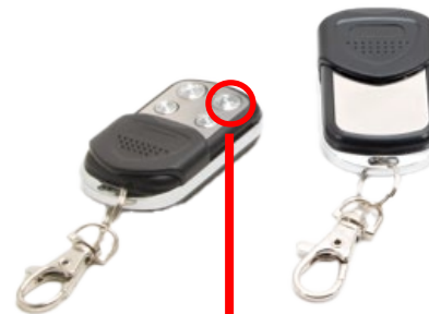
Wireless Key Fobs