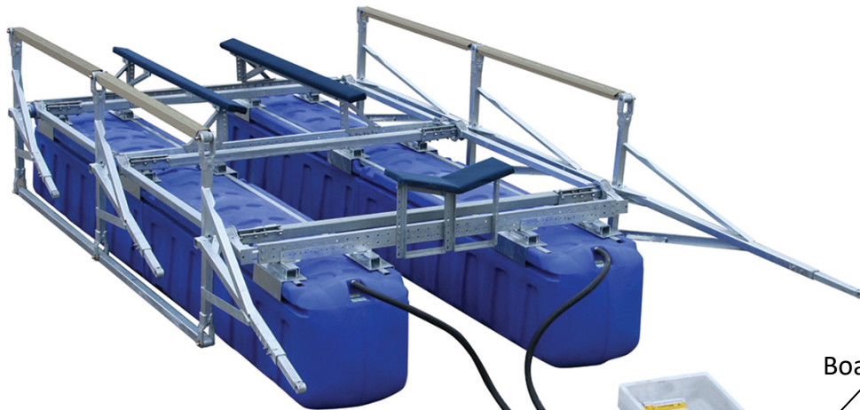
Boat Lift Control Box