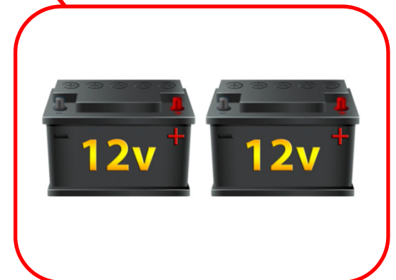
Two 12v Batteries